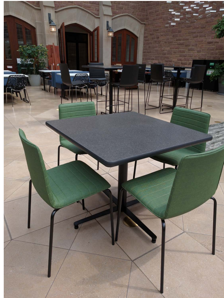
Berco Designs Anyway table series featuring leveling glides and varying top shapes and heights.

A: Crowder Hall is used as a dining and study area for the Washington University School of Law. The space hosts events every week, so the goal was durable and moveable tables.