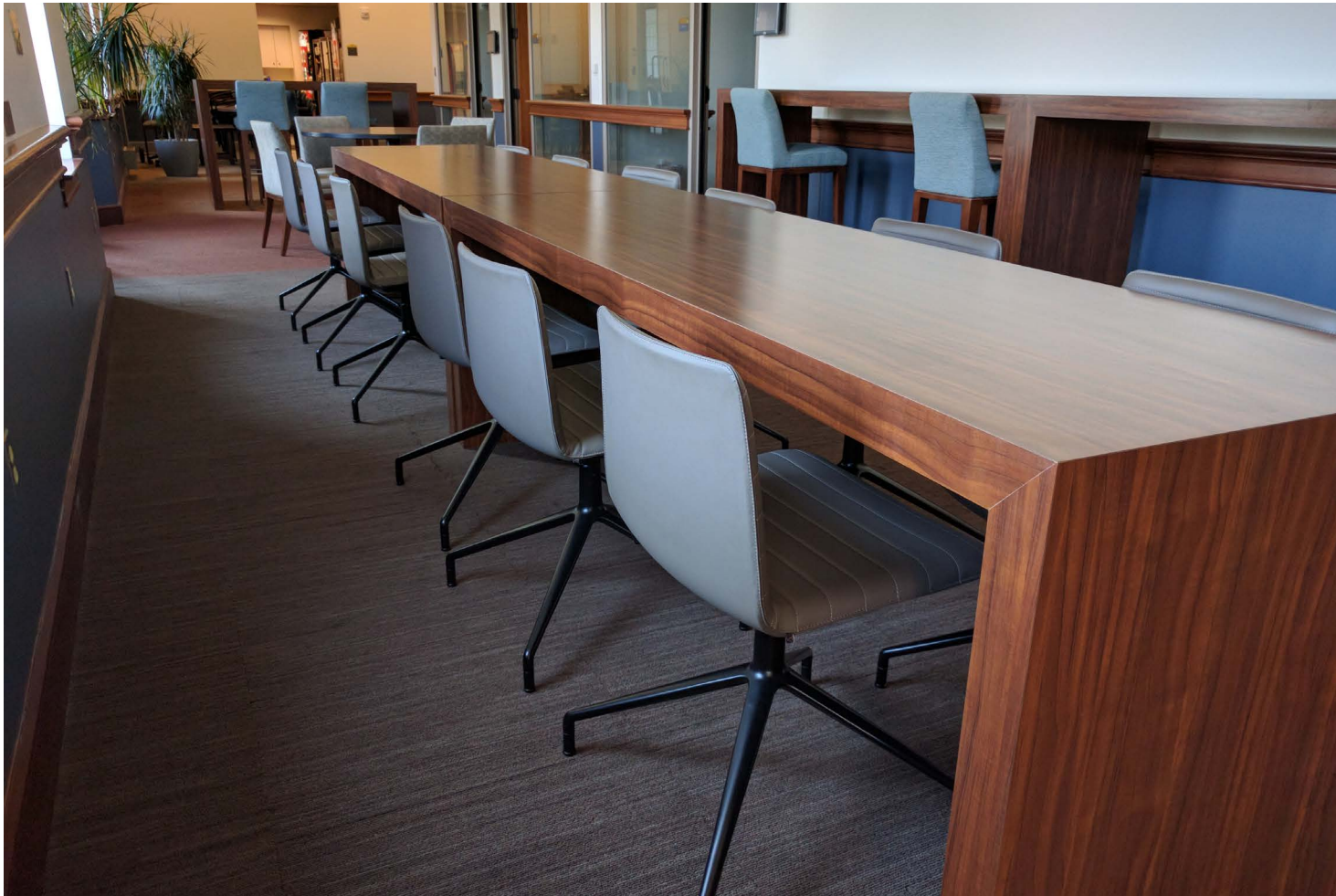
Berco Designs Encore Community tables in custom widths and heights, Wash-U School of Law.