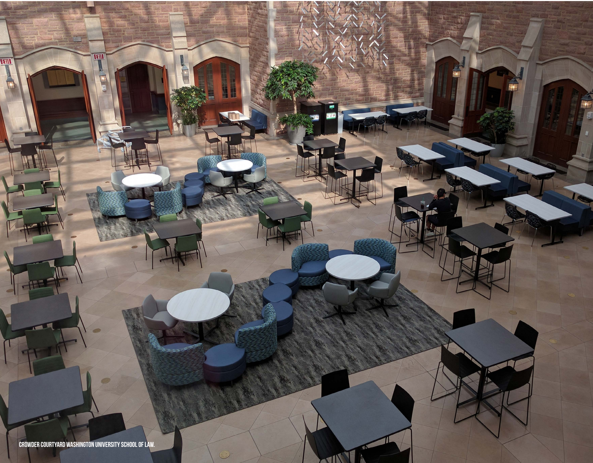
CROWDER COURTYARD WASHINGTON UNIVERSITY SCHOOL OF LAW.