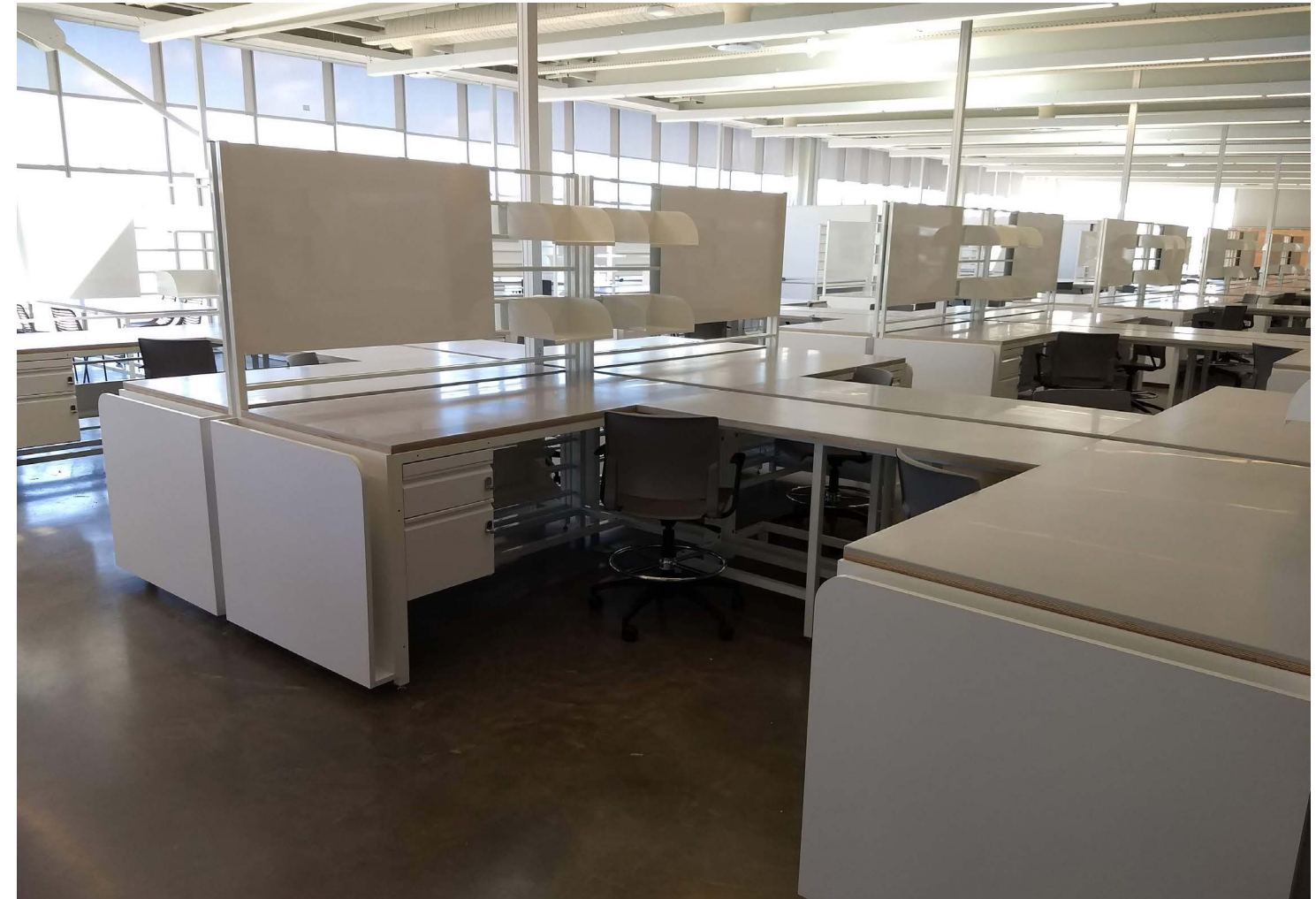
Custom Berco Designs desks in the Wash-U School of Architecture Graduate Studio.

The desk design allows architecture students to spread out. The tops are solid surface, so they're very durable. The students glue models together and the surface allows for more creativity without damaging the furniture. The design was intended to store large materials like foam core, large drafts and other project materials. The students can also provide their own locks for the custom drawer storage.